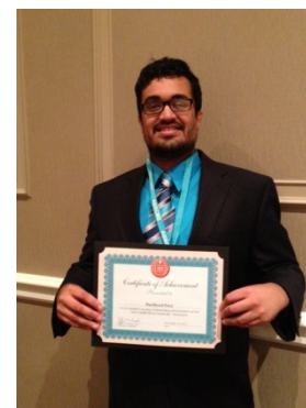
FASEB MARC Program's photos during the Pre-Conference Preparation Workshop at ABRCMS 2013, including one of the workshop participants who won a "Best Presentation" award at ABRCMS 2013.